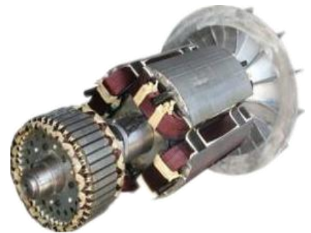
Big Shaft & Copper Wire

www.emeanpower.com Email: sale5@fjepos.com Phone: +86 19890349907